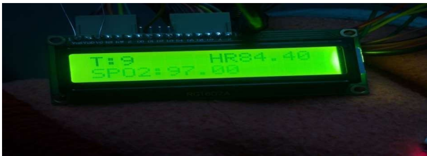
Picture1.Display of data

The final result of the system is we get a person's heart rate, body temperature and oxygen level on the display. A sixteen by two display is used to show the data, on that digital reading are displayed so anyone can easily detect and read the parameters. By checking the readings of parameters one can detect patients health But, if the readings are not in normal range then a person can immediately visit to the doctor. As shown in picture 1 three parameters are displayed where T is temperature, HR is heart rate and SPO2 is the oxygen level.